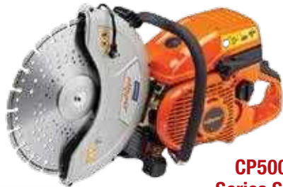
CP500 Series Saw