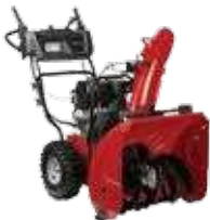
JONSERED ST 2376 EP Jonsered engine, 291 cc. working width 30 in.

requirements, while the two-stage system provides high throwing capacity in all snow conditions. The two bigger models come with power steering, flood headlights and electric starter as standard equipment. The single-stage unit is designed for walkways, patios and decks.