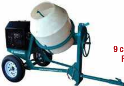
MC9PH240 9 cu. ft. Concrete Mixer Powered by Honda