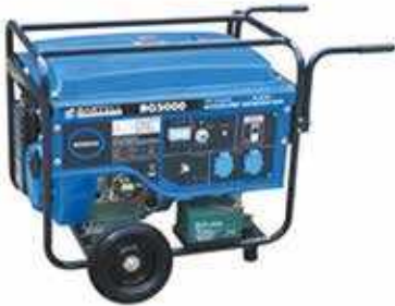
BG5000 & BG7000E Generators