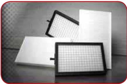
CABIN AIR FILTERS