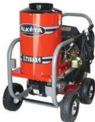
Electric & Gasoline Models