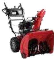
JONSERED ST 2368 EP Jonsered engine, 254 cc. working width 27 in.