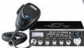
29 LTD Classic with Bluetooth