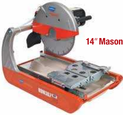
14" Masonry Saw