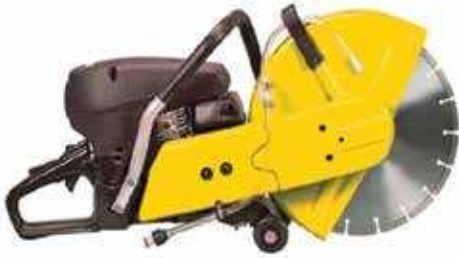
2-cycle Gas Saw