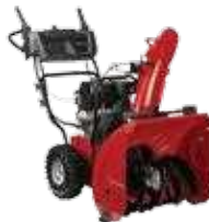
JONSERED ST 2361 Jonsered engine, 208 cc. working width 24 in.