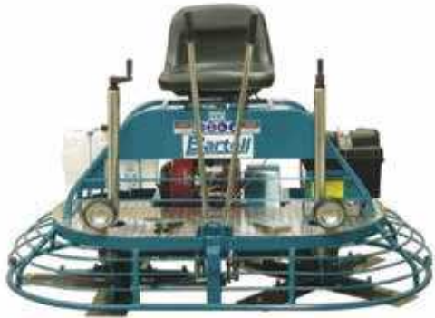
TS65 Ride On Professional Contractor Power Trowel