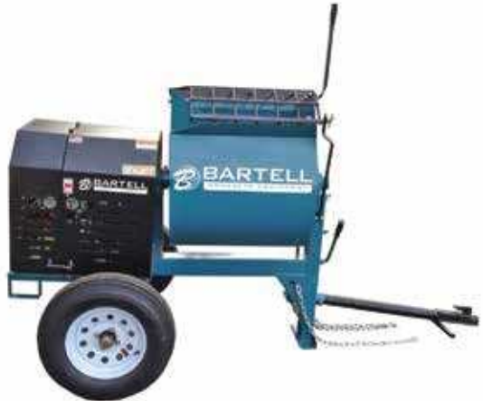
MM9H240 9 cu. ft. Steel Mortar Mixer