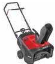
JONSERED ST 1153 EP Jonsered engine, 179 cc. working width 21 in.