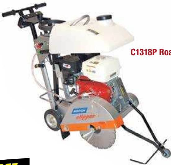
C1318P Road Saw