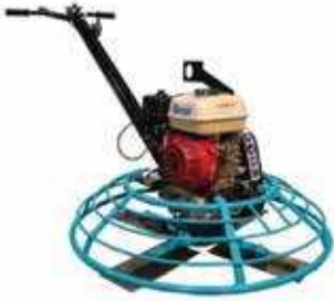
BC436 Commercial Grade Power Concrete Trowel