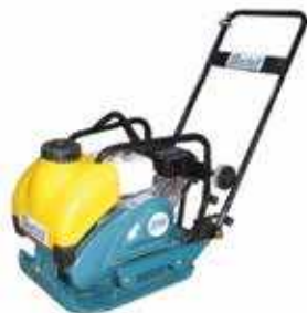
B200 Plate Compactor