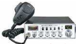
29 LTD Classic