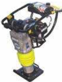
BR68 with Honda Engine