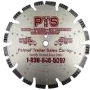
Wet/Dry 12"-18" Diamond Blades